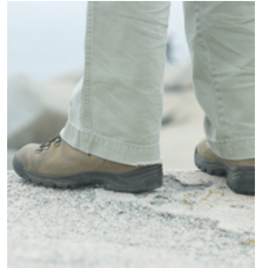
Add walking poles, and burn more calories.

For more information, visit www.walking.about.com/od/nordicwalking/index.htm .